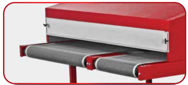
Optional split belt